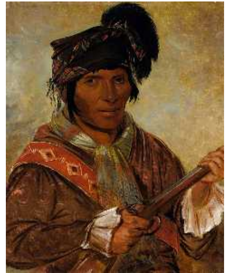
Kee mon saw, Little Chief of the Miami Tribe (1830)

techniques and a unique variety of white corn. While we acknowledge all the Historic Native People of Ohio, today we honor the legacy of the Indigenous Miami peoples, who cared for this land well before it came to be called Maumee Valley Presbytery.