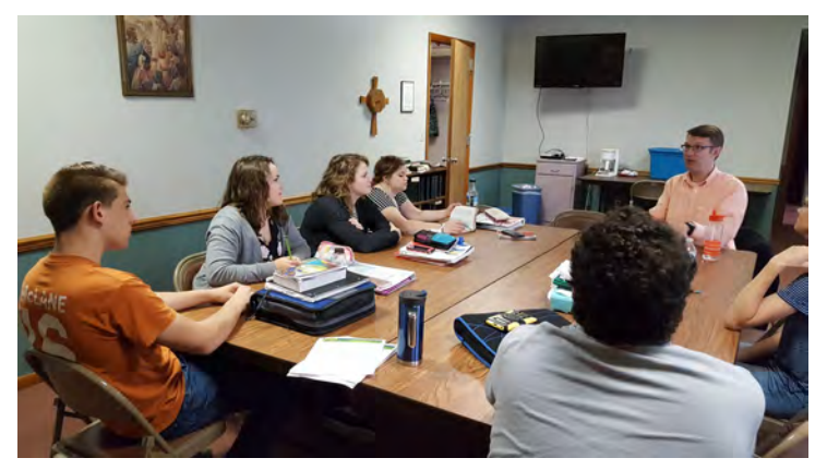
In Ohio, academic credit is available for high school Released Time classes.

Local school boards approve Released Time; more than 55% of districts already have policies.