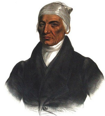
Catecahassa or Black Hoof (c.1740-1831) was the head civil Chief of the Shawnee in the Ohio Country.

The Shawnee not only developed a strong attachment to their new homeland in Ohio Country, but forged new alliances, helping foster a collective identity between once autonomous or long-separated bands, cooperating more closely, approaching modern definitions of “tribe” or “nation”. For their collective and community spirit we give thanks for the Shawnee people, and all the Historic Native Peoples of Ohio, who lived in the land we now call home, Maumee Valley Presbytery.